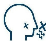
Loss of sense of smell and taste