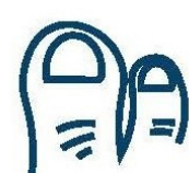
In children, purple markings on the fingers and toes