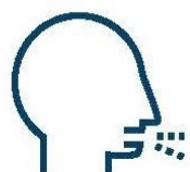
Cough (or worsening cough)